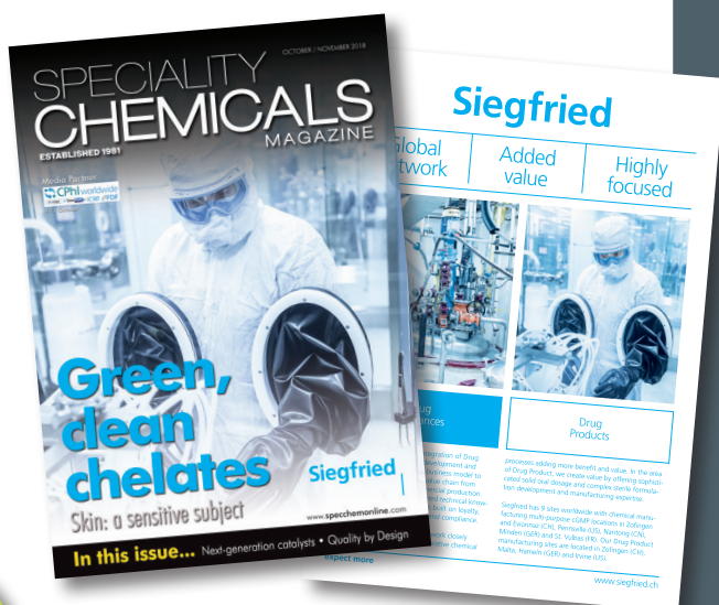
ABOVE: Front Cover / Inside Front Cover Combination Example